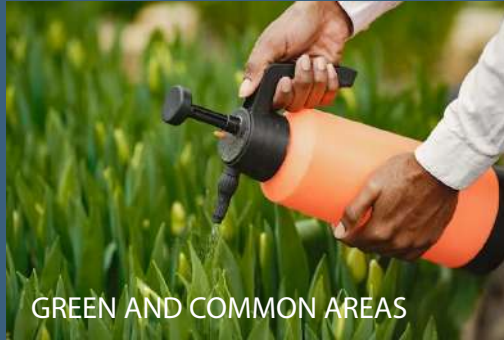
GREEN AND COMMON AREAS